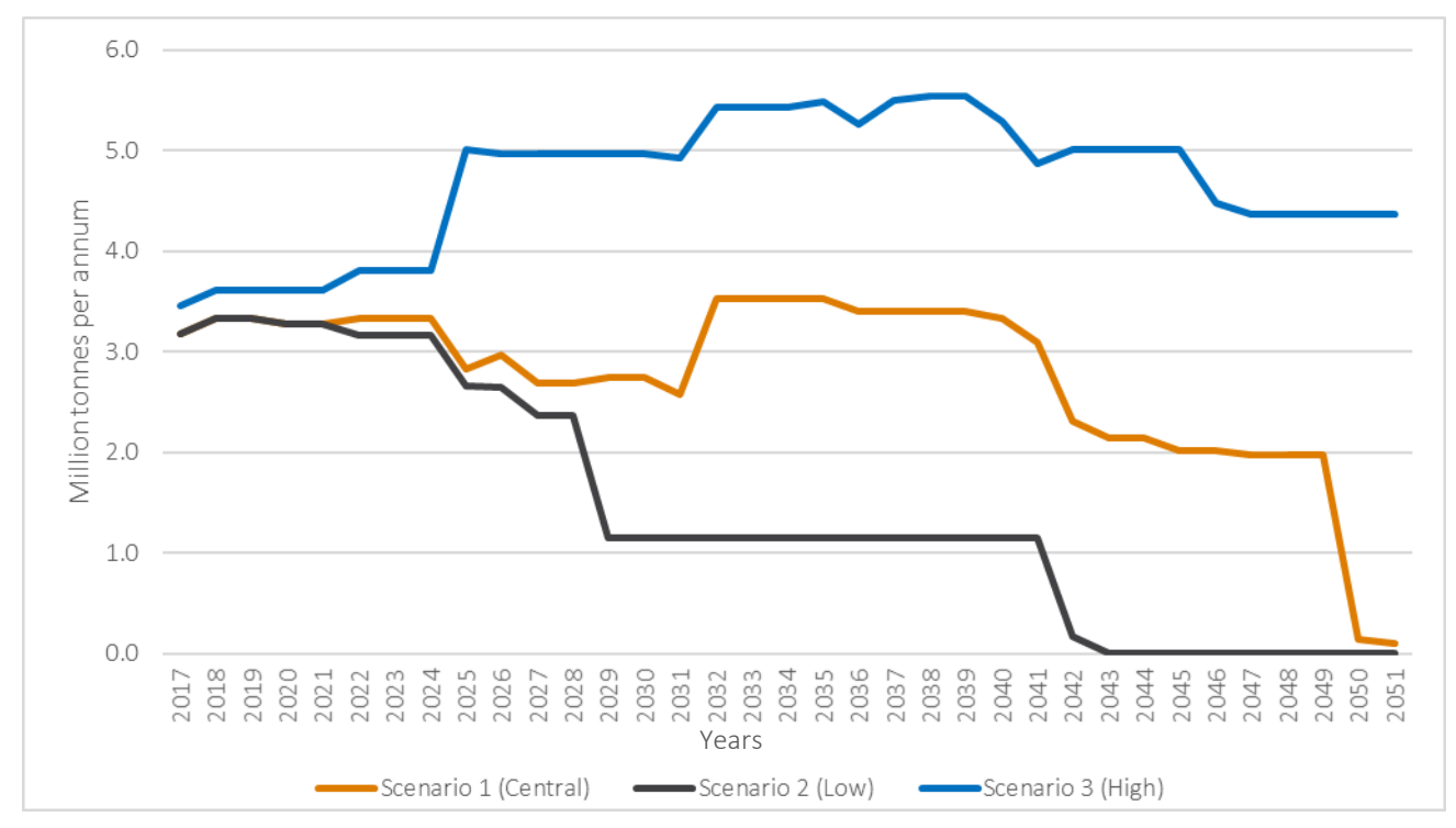
Figure 4.1 Minerals Demand Forecast for Each Scenario